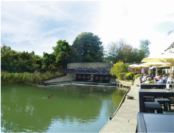
Figure 2. A visualisation of what the new weir will look like, with new fish pass structure.